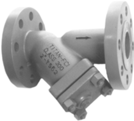
2" YS 62-CS

Class 300 lb • Carbon Steel and Stainless Steel