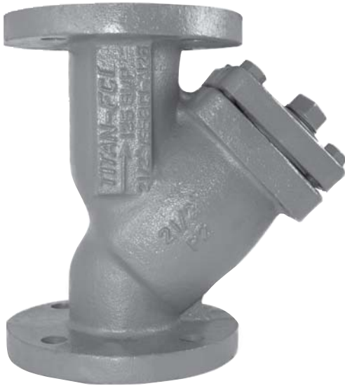
2 1/2" YS 58-CI